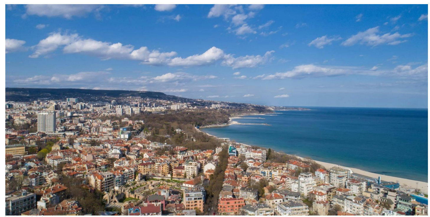
Varna aerial view City from above