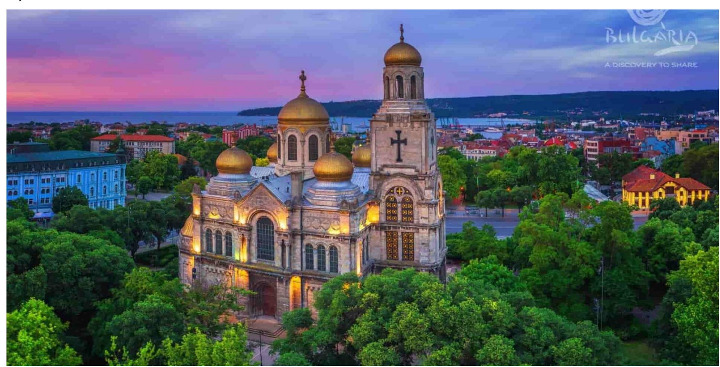
Varna cathedral Most prominent landmark